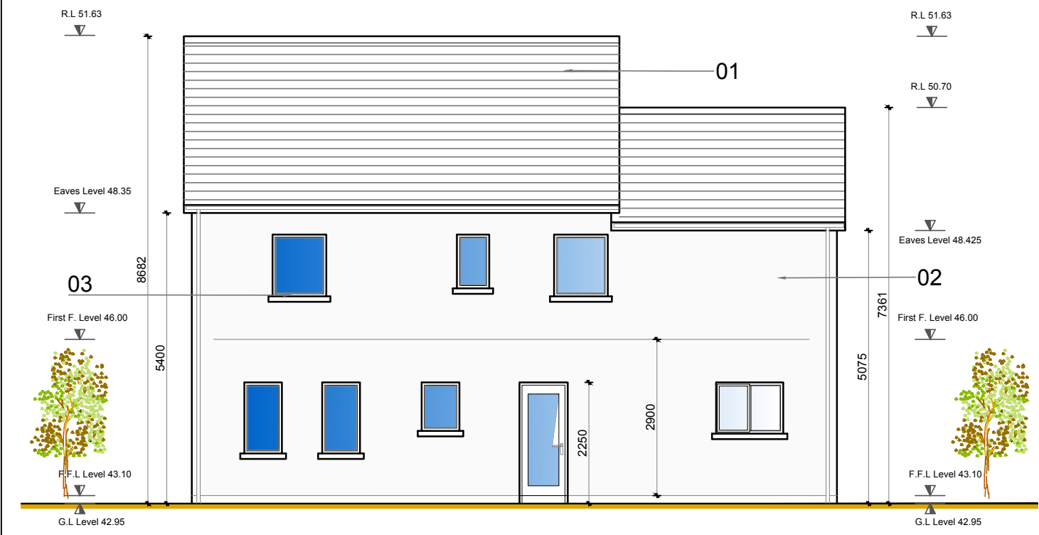
No.1 - EAST ELEVATION SCALE 1:100 A3