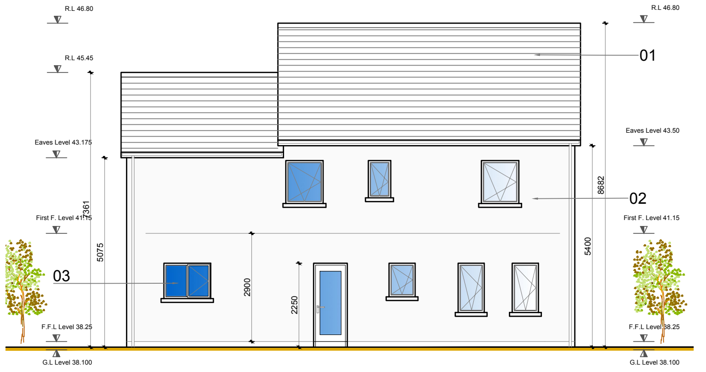
No.2, No.5 & No.6 - EAST ELEVATION SCALE 1:100 A3