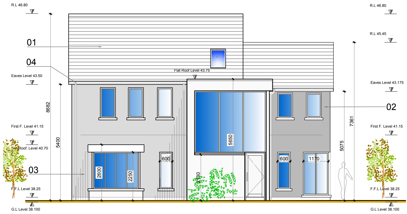
No.2, No.5 & No.6 - WEST ELEVATION SCALE 1:100 A3