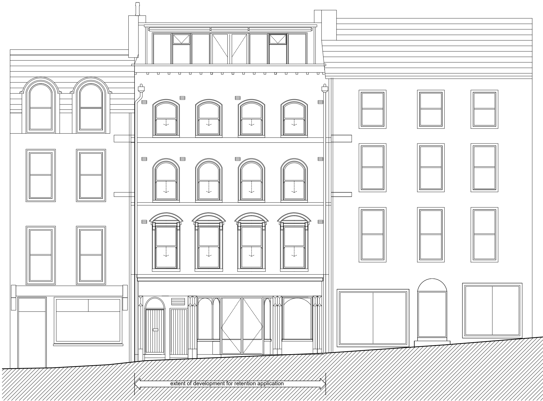
Existing Front Elevation SCALE 1: 100